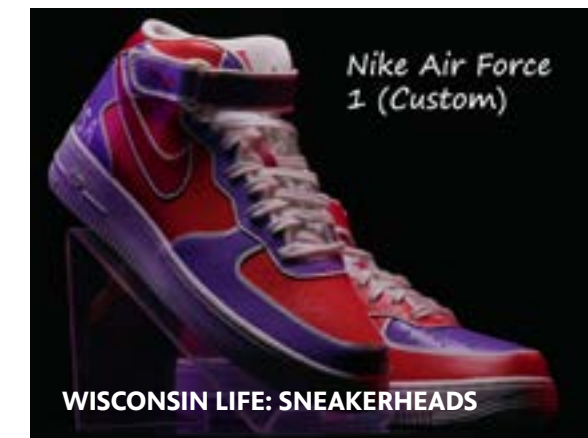
WISCONSIN LIFE: SNEAKERHEADS