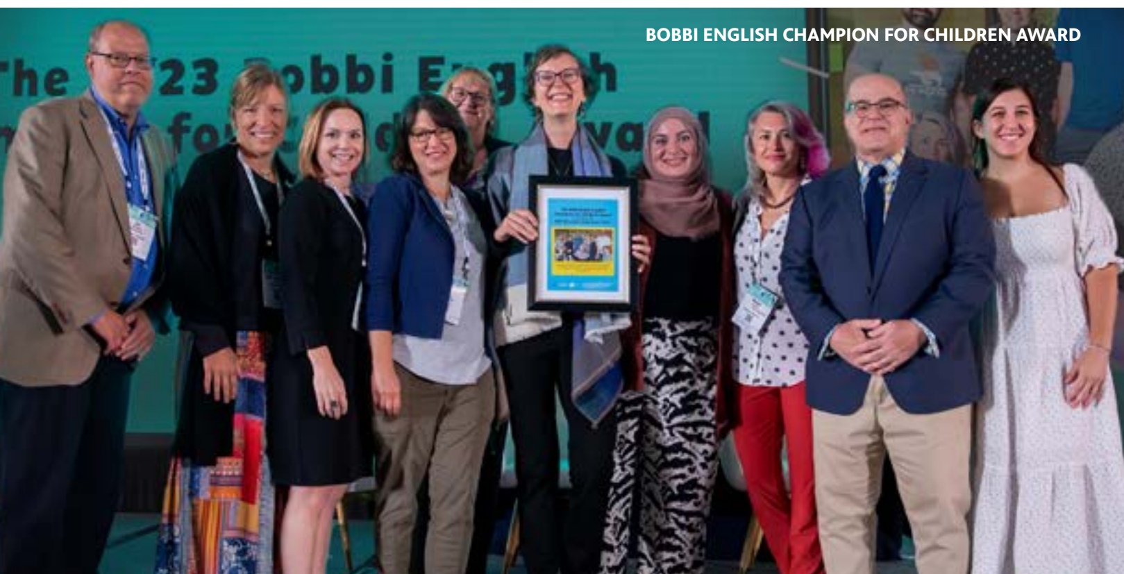
BOBBI ENGLISH CHAMPION FOR CHILDREN AWARD