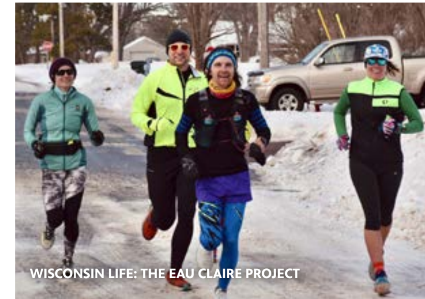
WISCONSIN LIFE: THE EAU CLAIRE PROJECT