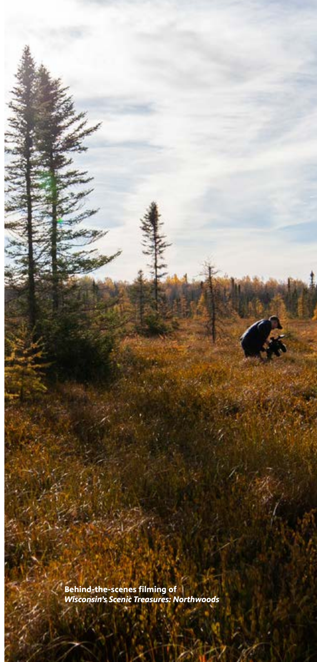
Behind-the-scenes filming of Wisconsin's Scenic Treasures: Northwoods