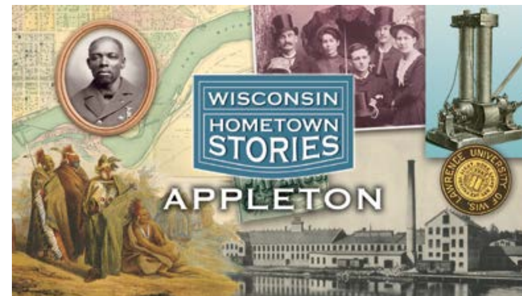
Facing page: Wisconsin Hometown Stories: Appleton community premiere screening at Poplar Hall